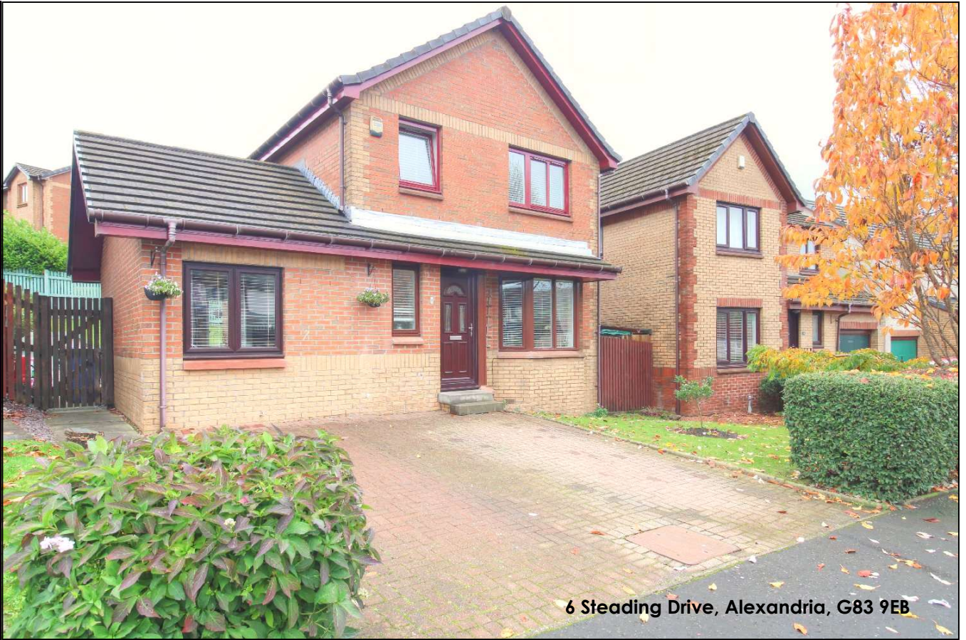
6 Steading Drive, Alexandria, G83 9EB

David Muir Estate Agents are delighted to present to the market this fantastic four bedroom extended detached villa which is located in this popular and peaceful residential estate and which benefits from double glazed windows and gas central heating.